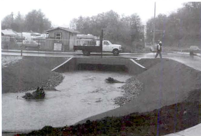
10th Avenue So. culvert during October 20th storm

The Engineering Department is located at 21650 11th Ave. So.